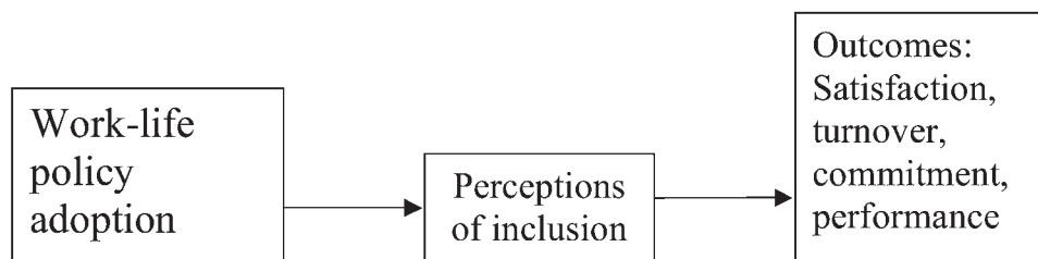
FIGURE 1a. Conventional View of Link Between Adoption and Inclusion

Variability in implementing any human resource policy can affect inclusiveness; work-